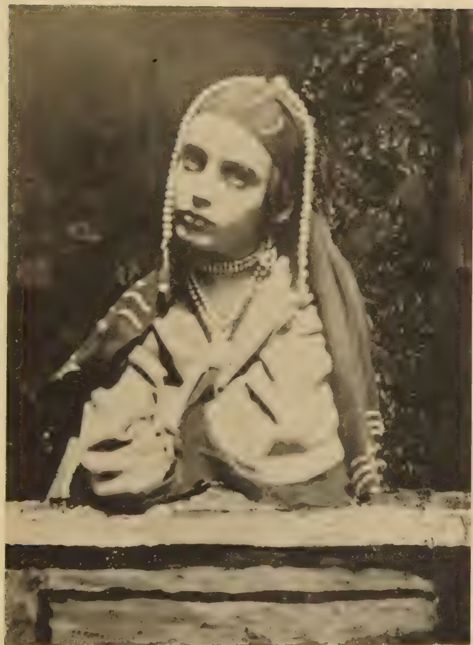
The Russian Princess as a Child